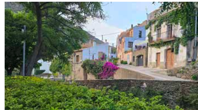
Charming narrow passages and street corners

We're a small town with surprises on every corner for those who want to discover them. Let yourself get lost in our narrow streets; you'll run across the hidden secrets of our cultural and gastronomic heritage.