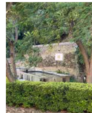
The municipal laundry