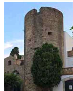
The defensive tower of Camp de l'Obra